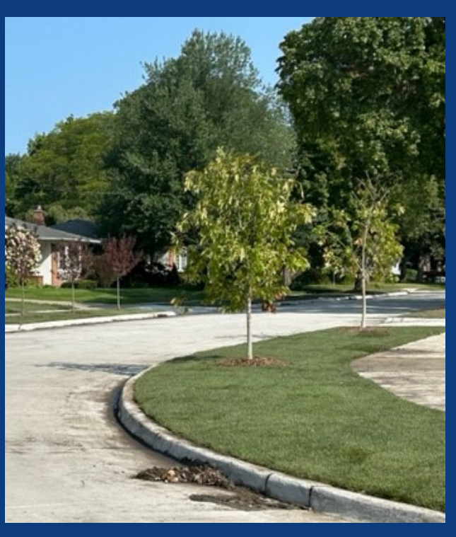
Restoration crews are working to finish up the landscaping and new tree planting along the new stretch of Carol and Evergreen streets.